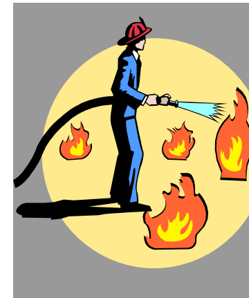
Firefighters R Hot! WE FIGHT WHAT YOU FEAR