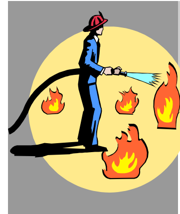
Firefighters R Hot! WE FIGHT WHAT YOU FEAR

I planted some bird seed. A bird came up. Now I don't know what to feed it. How can there be self-help groups? If swimming is so good for your figure, how do we explain whales? Show me a man with both feet firmly on the ground, and I'll show you a man who can't get his pants off. Is it my imagination, or do buffalo wings taste like chicken?